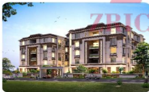
JYOTHI SARADA NEST Banjara Hills, Road No. 2