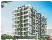
JYOTHI COSMOS Hitech City, Opp.Tech Mahindra