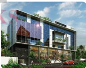
JYOTHI TITAN Near GVK, Banjara Hills, Road No. 1